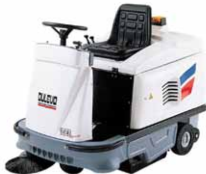
Model: DULEVO 1000 SPRINT (EH)

Sweeping Path Min.: 700 mm Sweeping Path Max.: 1100 mm Cleaning Performance: 7200 sqm/h Waste Hopper Capacity: 70 L Filtering Surface: 4 sqm Fuel: Battery