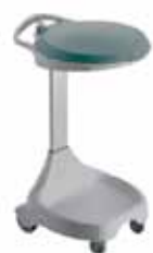
Elle 23L Plastic bag-holder with a wide ring and round edges and smooth surfaces for easy external cleaning. Complete with a handle to move the trolley easily, 2 non marking wheels 125 mm and 2 plastic feet. For bags from 70/75x110 cm to 80/85x110 cm. Available in two basic.