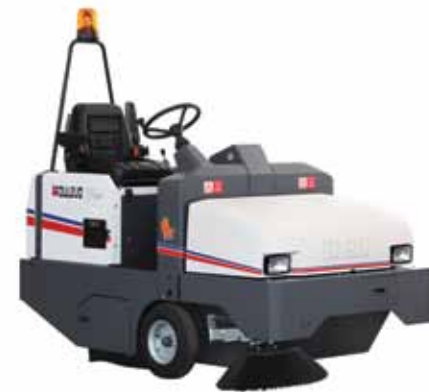
Model: DULEVO 100 DK

Sweeping Path Min.: 700 mm Sweeping Path Max.: 1100 mm Cleaning Performance: 7200 sqm/h Waste Hopper Capacity: 70 L Filtering Surface: 4 sqm Fuel: Battery