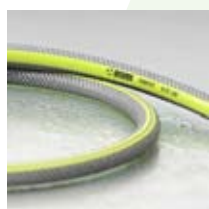
Model :Slide line Dimension : 13 mm , 19 mm Burst pressure : 30 bar