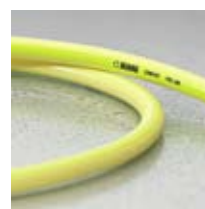
Model :Pro line Dimension : 13 mm , 19 mm Burst pressure : 30 bar