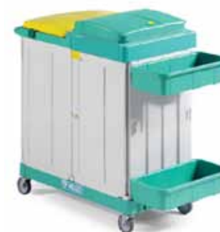
Magic Line 460 E