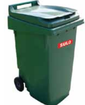
Brand: SULO Model: MGB 360 Nominal Volume (l) 360