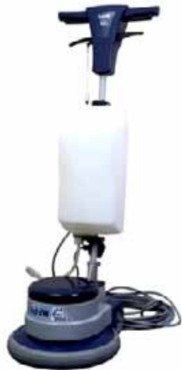
Brand: WIRBEL Model: E33 Specifications Working Width: 330 mm Brush Speedgiri/min.: 190 Brush Motor Rating: 550 W Dim.: 1120x420x340 mm Weight: 22 Kg