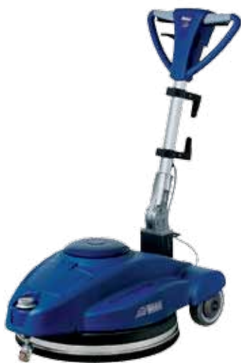
Brand: WIRBEL- GHIBLI Model: C 150 U13 Specifications Working Width: 505mm Brush Speedgiri/min: 1500 Brush Motor Rating: 1300W Dim.: 1130x870x520mm Weight: 42Kg