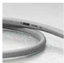
Model :Eco Dimension : 13 mm , 19 mm Burst pressure : 30 bar