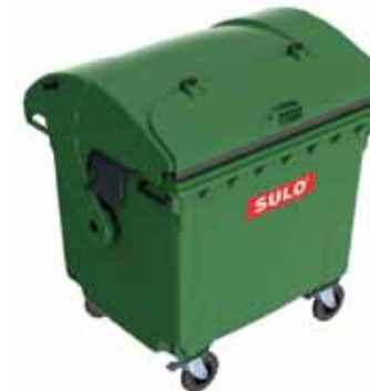
Brand: SULO Model: MGB 1100 RD-DID Nominal Volume (l) 660