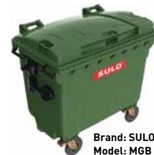
Brand: SULO Model: MGB 660 Nominal Volume (l) 660