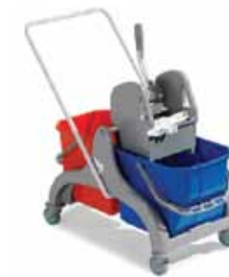
Trolley Light Grey 50 L