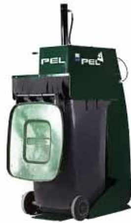
BIN COMPACTORS Model: 240 L