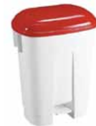
Derby 60L Size WxDxH: 50x36x68 cm Material: Polypropylene Lid Colours: Blue, Red Green, Yellow & Brown