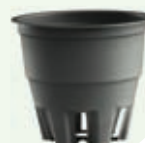
Seedling trays- Desch