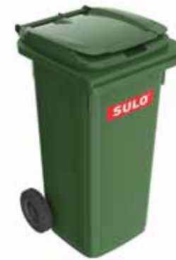
Brand: SULO Model: MGB 120 Nominal Volume (l) 360