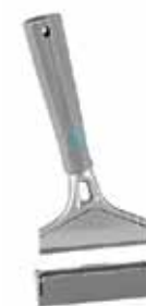
Scraper with Handle Recommended to scrape surfaces, it has an adjustable handle. Blade protections avoid any unpleasant problem to operators. Blades are replaceable.