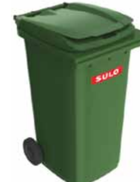
Brand: SULO Model: MGB 240 Nominal Volume (l) 360