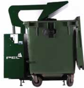
BIN COMPACTORS Model: 1100 / 660 L