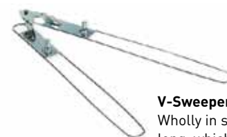
V-Sweeper Metal Frame Wholly in steel, it is made of two skids 100 cm long, which can be opened up to 140°.