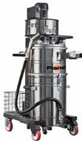
Brand: IPC SOTECO INOX Model: Planet Optim 3m INOX Specifications Air Consumption (L/min): 1300 Feeder Pressure (bar): 6 Air Flow (m3/h): 360 Filter Surfaces (cm2): 24000 Tank Capacity: 70L Noise: dB(A) ←85