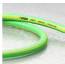
Model :Green line Dimension : 13 mm , 19 mm Burst pressure : 30 bar