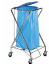
Dust Size: 60x62x102 cm Chrome-plated trolley, used to remove rubbish. It can be provided with a 120 L bag resting on a sturdy grid base. A useful pedal and a handy lid (preventing bad smells from coming out) make it a complete tool in the gathering of any materials, helping.