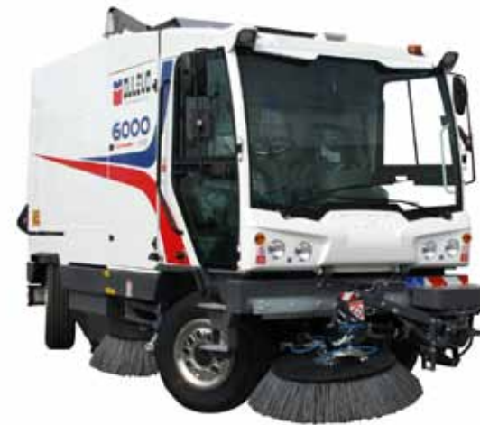
Model: DULEVO Combi

Sweeping Path Min.: 1300 mm Sweeping Path Max.: 2600 mm Cleaning Performance: 78000 sqm/h Waste Hopper Capacity: 2500 L Filtering Surface: 19 sqm Fuel: Diesel