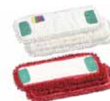
Wet System Polyester Head The universal ring enables the use of any handle with a diameter ranging from 20 to 24 mm.