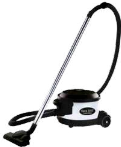
Brand: PROFESSIONAL Model: ED1000 Specifications Power: 1400 W (max) Bag Capacity: 10 L (Paper or Cloth Bag) Weight: 6.2 Kg Canister Construction: Steel Max.Working Radius: 19 m Cable Length: 15 m