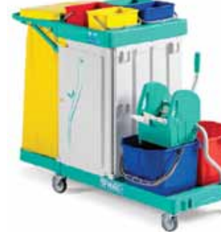
Magic Line 350 S