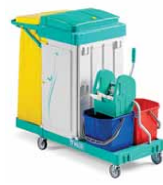
Magic Line 450 S