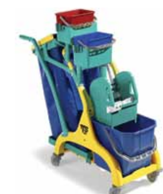
Nick Star 30