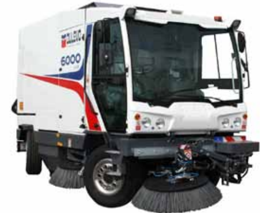
Model: DULEVO 6000

Model: 3000 Sweeping path central brush: 1300 mm Sweeping path side brushes: 2100 mm Cleaning performance: 87000 sqm/h Waste hopper capacity: 3300 Lt. Filtering PM10: 99% Fuel: Diesel