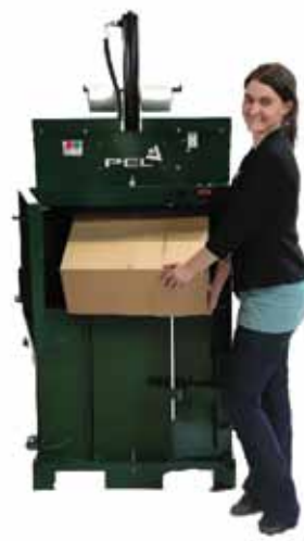
BALERS Model: 700 Baler