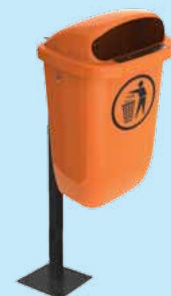
Model: SULO POLE BINS 50 L with pole