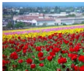
Heikes speciality Flower seeds