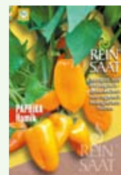
Reinsaat organic vegetable seeds