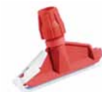
I Mop Polypropylene clamp for mop and Special Mop. It can be re-used and the mop easily replaced, while the universal joint allows the use of any handle with a diameter from 20 to 24 mm.