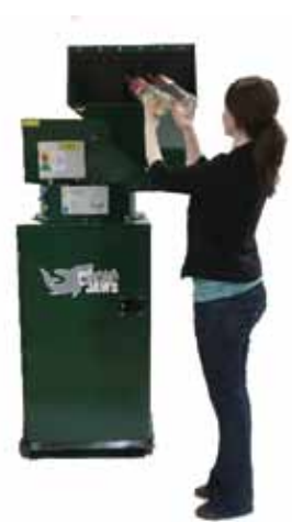
BOTTLE CRUSHER Model: Mega Jaws BB06