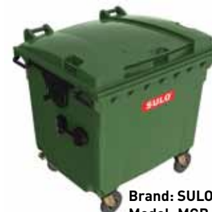
Brand: SULO Model: MGB 1100 FD Nominal Volume (l) 1.100