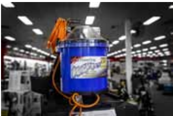
Brand: POWERVAC Model: T1 Specifications Max Power: 1450 W Rated Power:1350 W Paper Filter Bag Capacity: 3.3 L Air Flow Rate: 51 L/s Cable: 15m Weight: 4.8 Kg