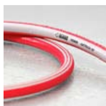
Model :Quattroflex top Dimension : 13 mm , 19 mm Burst pressure : 50 bar