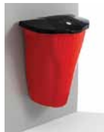
Wall-Up 50L Size WxDxH: 53.5x39x82 cm Material: Polypropylene Unit Net Weight: 3.93 Kg Gross Weight Package: 5.45 Kg