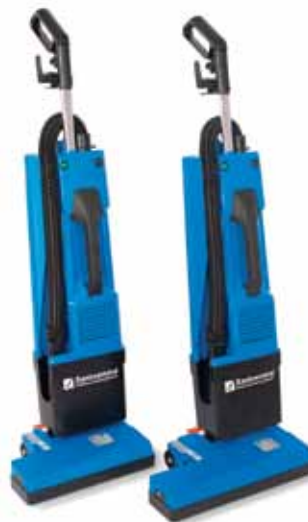
Brand: UP-RIGHT VACUUM-SANTOEMMA (ITALY) Model: BT350 & BT450