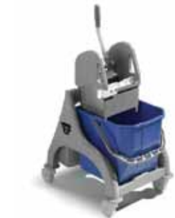
Nick - 25 L