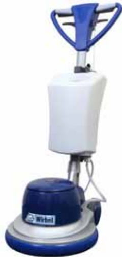
Brand: WIRBEL Model: E43 ERGLINE & Bi-SPEED Specifications Working Width: 430 mm Brush Speedgiri/min.: 154-308 Brush Motor Rating: 1000-1300 W Dim.: 1200x542x430 mm Weight: 41-44 Kg