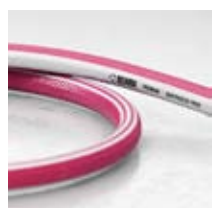
Model :Quattro flex profi Dimension : 13 mm , 19 mm Burst pressure : 50 bar