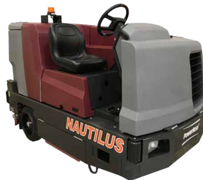
Model: Nautilus Rider scrubber/sweeper Specifications Side brush min: 1530 mm Side brush max: 166.4 mm Sweeping Path: 1140 mm Main broom: 1140 mm Cleaning Performance :2234sqm/h