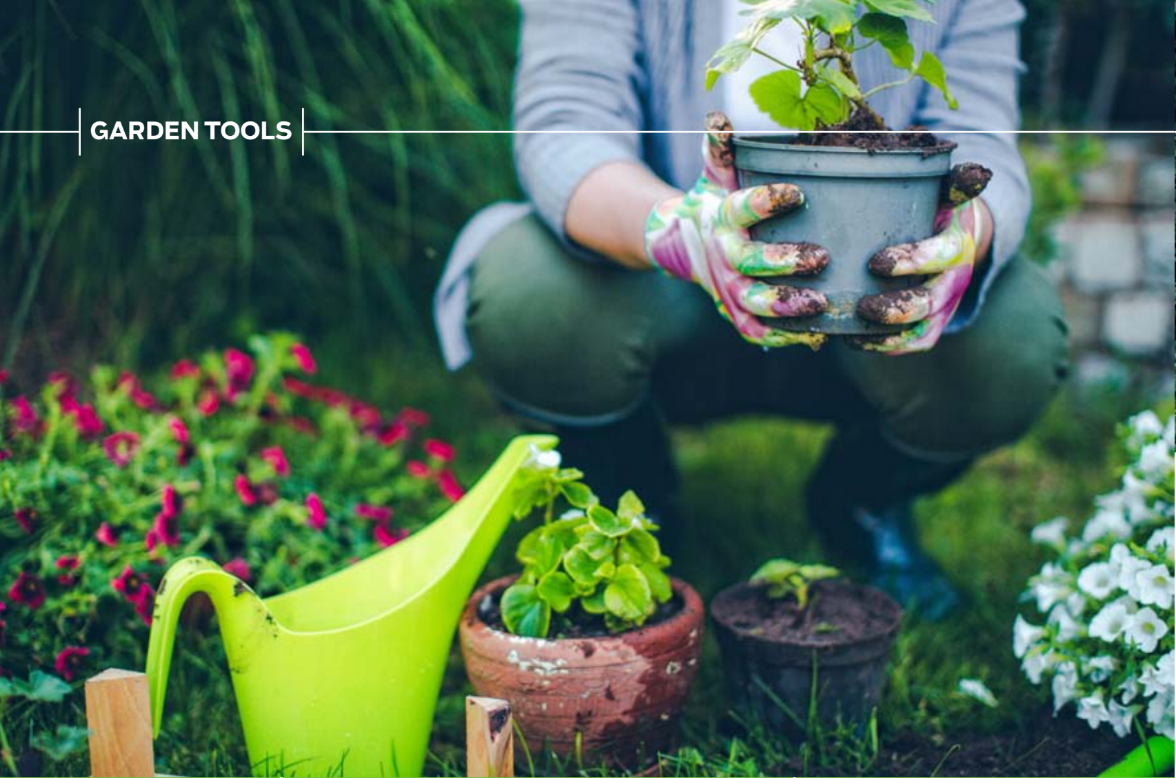
Kamaki Garden Tools