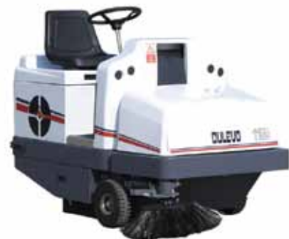
Model: DULEVO 100 ELITE (EH)

Sweep Width Centre Side: 1000 mm Sweep Side Brush Width: 1350 mm Working Capacity: 18000m 2 /h Capacity of Dirt :400 L Power: 18 Kw Weight: 1230 Kg Dimensions (LxWxH): 2315x1410x1540 mm