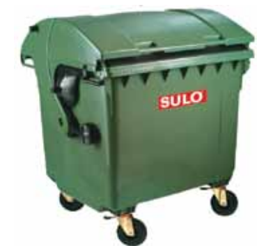
Brand: SULO Model: MGB 1100 RD Nominal Volume (l) 1.100