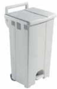
Derby 90L Size WxDxH: 52x48x93 cm Material: Polypropylene Lid Colours: Blue, Red Green, Yellow & Brown