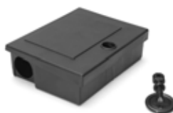
Rat Bait station