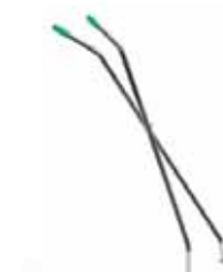
CP V-Sweeper Handle Equipped with a plastic reinforcement joining its two portions, it is made of chromed steel and is used with V-sweeper mop-heads and frames to dust wide open spaces.