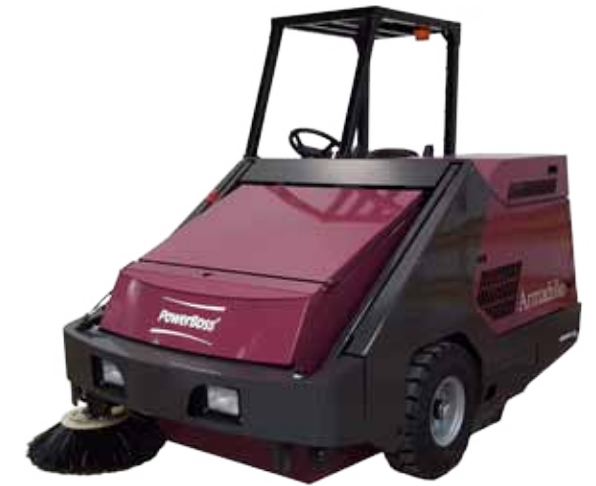
Model: Armadillo 10X Specifications Sweeping path: 1830 mm Main broom: 1420 mm Cleaning Performance :2322sqm/h