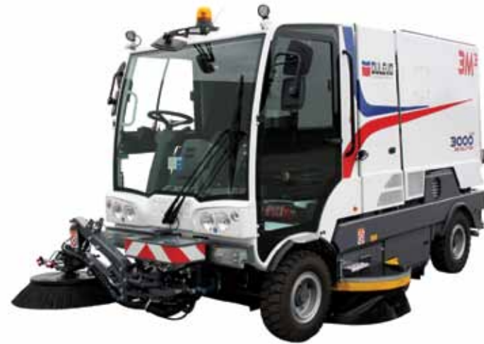
Model: DULEVO 3000

Model: 3000 Sweeping path central brush: 1300 mm Sweeping path side brushes: 2100 mm Cleaning performance: 87000 sqm/h Waste hopper capacity: 3300 Lt. Filtering PM10: 99% Fuel: Diesel