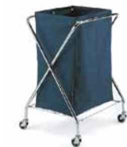
Linen Trolley Dust