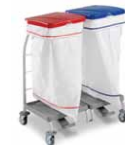
Double Linen Trolley