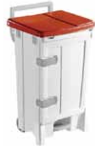
Derby 90-L Open-Up Size WxDxH: 52x48x93 cm Material: Polypropylene Lid Colours: Blue, Red Green, Yellow & Brown