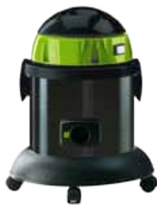
Brand: SOTECO Model: 171 Specifications Power: 1200 W (max) Volts: 220-240 V Tank Capacity: 17 L Weight: 7 Kg Air flow: 228 m3/h