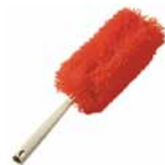
Dusters - Acrylic Acrylic duster, U-opening, ideal to dust the surfaces and gaps of heaters. It is made of a plastic support and an acrylic spare mop. Washing tem