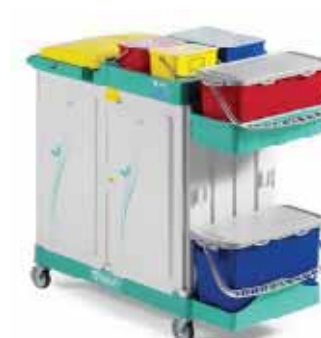
Magic System 720 E