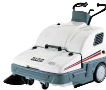
Model: DULEVO 900 SPRINT (EH)

Sweeping Path Min.: 520 mm Sweeping Path Max.: 700 mm Cleaning Performance: 3500 sqm/h Waste Hopper Capacity: 40 L Filtering Surface: 1.5 sqm Fuel: Battery