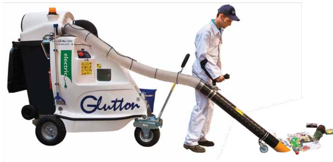
Model: WASTE VACUUM CLEANER