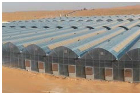
Hydroponic green houses