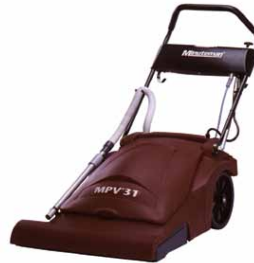
Model: MPV 31 Specifications Sweeping path: 762 mm Cleaning Performance :2322sqm/h