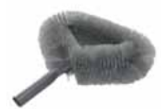
Dusters & Cobweb Cobweb and dust collector is ideal for all those high areas you just can't get to.