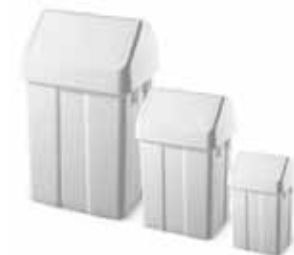
Max 50L /25L /12L Swinging lid to drop off easily the garbage. Removable lid to empty for easy cleaning. Available with coloured lids to encourage waste separation. Ideal for medium-large rooms (food service, schools & stations)