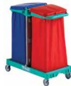
Magic Line 100B Size WxDxH: 92x58x104 cm Material: Polypropylene Unit Net Weight: 12 Kg Gross Weight Package: 13 Kg Volume Package: 0.18 (m3)