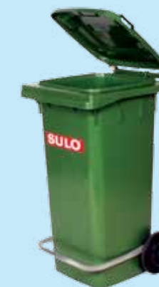
Model: SULO PEDAL BINS 120 L with Pedal