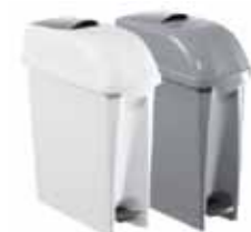
Elle 23L Size WxDxH: 20x42x67 cm Material: Polypropylene Colours: White & Grey