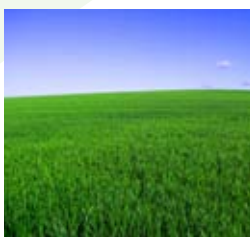
Arizona Seed Technology, Inc. Arizona Bermuda grass seeds