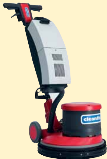
Brand: CLEAN FIX Model: E450 Specifications Working Width: 440 mm Brush Motor Rating: 1500/230 W Weight: 39 Kg