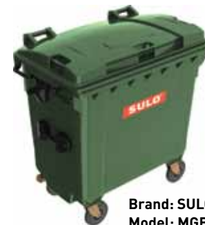
Brand: SULO Model: MGB 770 Nominal Volume (l) 770