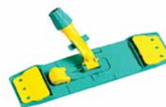
Plastic Frame Wet System Frame for disinfection or washing made of shock-proof plastic.