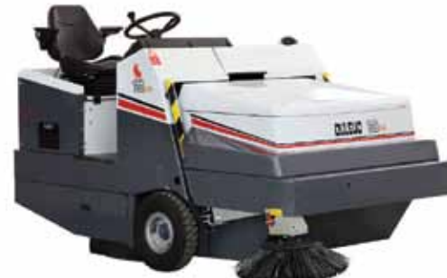
Model: DULEVO 120 ELITE (EH)

Sweeping Width: 1100mm Centre Brush: 750 mm Side 2 Brushes Width: 1440 mm Filter Surface Area: 6 m/sq Maximum Speed: 6 km/h Working Capacity: 11,600 m 2 /h Waste Hopper Capacity: 220 L Weight: 570 Kg Dimensions (LxWxH): 1990x1230x1400 mm