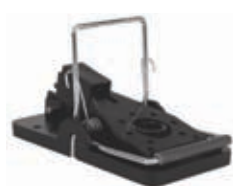
Mouse snap trap