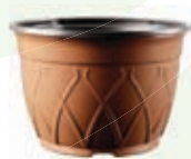
Plant Pots -Desch