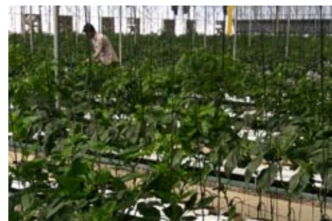
Automated green house