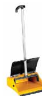
Dust Pan Clip Strong and shock-proof, it is equipped with a thin rubber layer perfectly adhering to the floor and helping in collecting even very thindust.