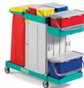
Magic System 720 S