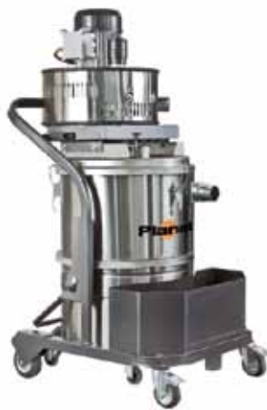
Brand: IPC SOTECO ATEX Model: Planet Optim 3m ATEX Wet & Dry Specifications Motor: 3 KW Air Flow (m3/h): 320 Waterlift (mm H2O): 3100 Filter Surfaces (cm2): 12000-24000 Tank Capacity: 50-70L Noise: dB(A)←85 Weight: 22 Kg