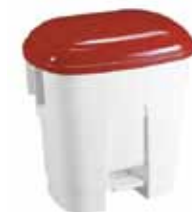
Derby 30L Size WxDxH: 36x50x51 cm Material: Polypropylene Lid Colours: Blue, Red Green, Yellow & Brown