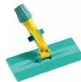
Terfir - Jointed Scrubber The universal ring enables the use of any handle with a diameter ranging from 20 to 24 mm.