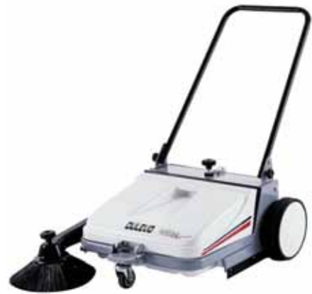
Model: DULEVO 700M

Sweeping Path Min.: 520 mm Sweeping Path Max.: 700 mm Cleaning Performance: 3500 sqm/h Waste Hopper Capacity: 40 L Filtering Surface: 1.5 sqm Fuel: Battery