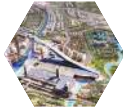
Meydan Project Dubai