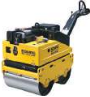
Walk Behind Roller Compactor