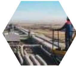
Al Taweelah Project Abu Dhabi