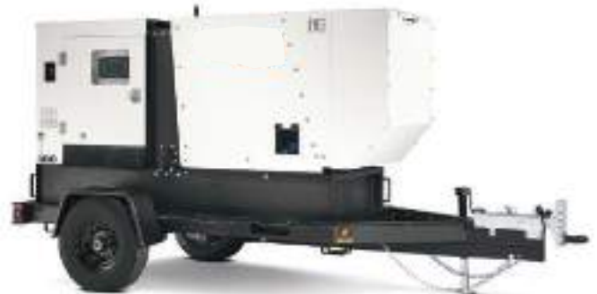
Emergency Portable Generator