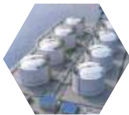
Alzour LNG Kuwait