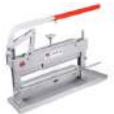
Inter Lock Tile Cutter