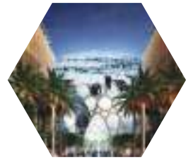
Various Projects in Expo 2020, Dubai