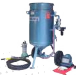
Sand Blasting Pot