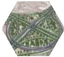
New Orbital Highway Project Qatar