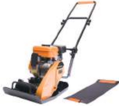
Plate Compactor with rubber