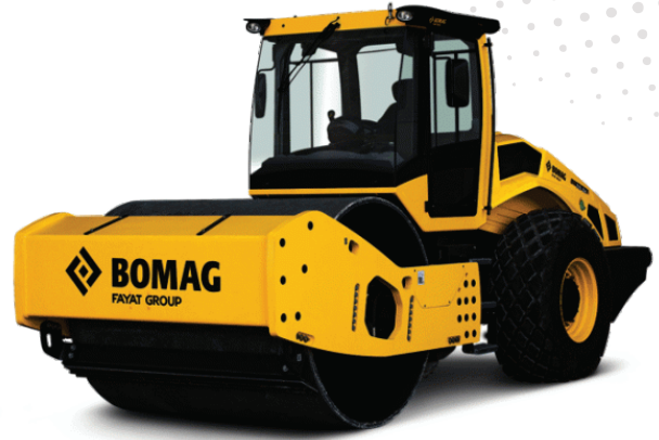
10 Ton Roller Vibratory Soil Compactor