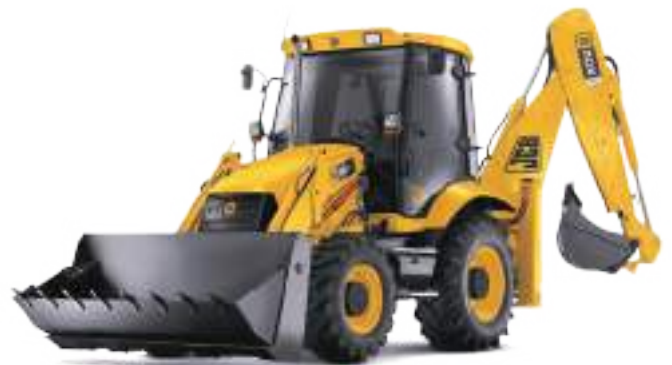
Back Hoe Loader