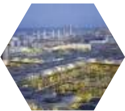
Alzour Kipic Kuwait