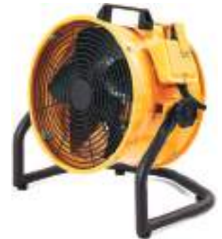
Blower Exhaust Fan