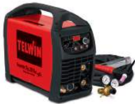
Electrical Welding Machines