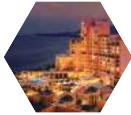
1100 Villas Project Fujairah