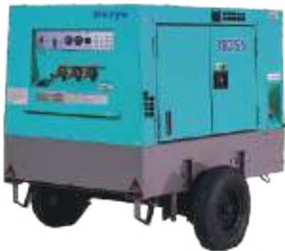
Diesel Welding Machines