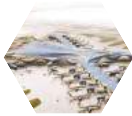
Midfield Terminal Complex Abu Dhabi