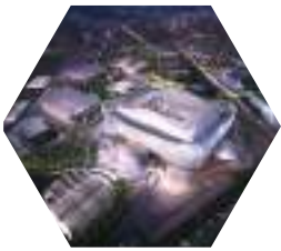
Al Rayyan Stadium Project Qatar