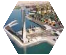
Hamad Port Qatar