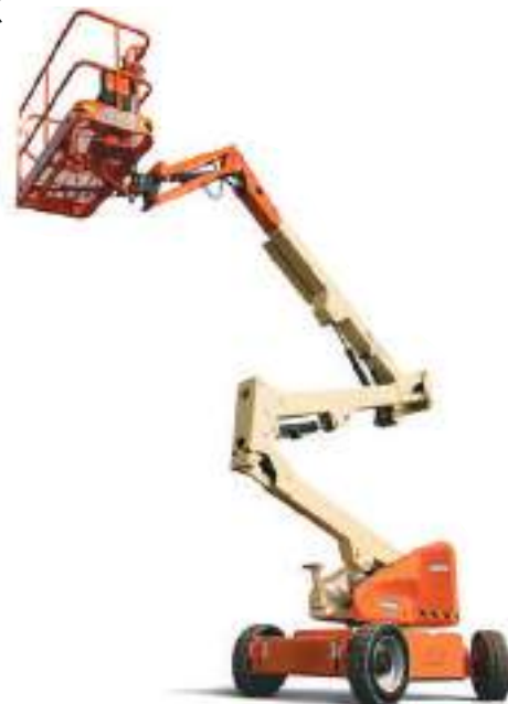
Articulated Boom Lift