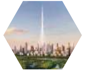
Creek Tower Project Dubai