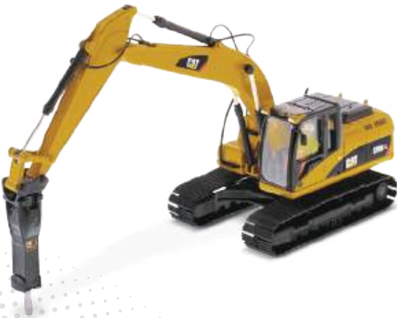
Excavator with Breaker