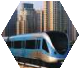
Metro Rail Expansion to Expo 2020 – Dubai