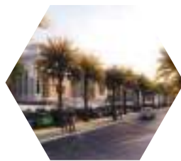
Muthla Housing Project Kuwait